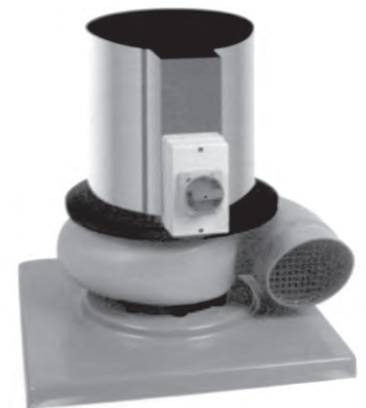
Plastec 35 with Roof Unit Kit