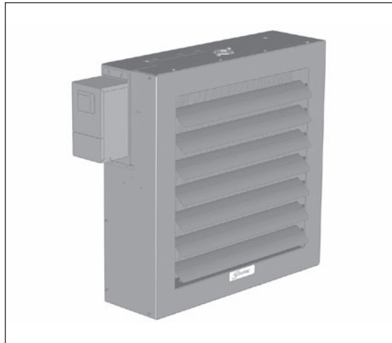
Figure 2.1 Field Installed Transformer Accessory