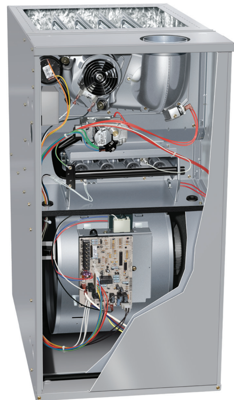
N80 Gas Furnace

Airquest gas furnaces are designed for durability and comfort. The warmth and efficiency of natural gas combined with a quiet, efficient blower motor delivers comfort throughout the cold seasons. The gas furnace can also be combined with an indoor evaporator coil and properly matched outdoor air conditioner or heat pump to provide cooling during the warm seasons.